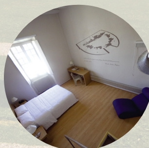
8 HOTEL - BERNIERS