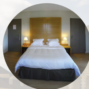
3 HOTEL - GABELLE