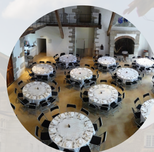
5 DINING ROOM